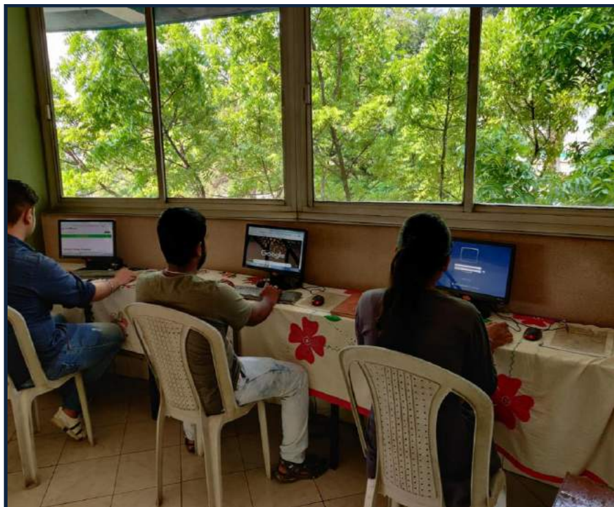
Picture 6 Library