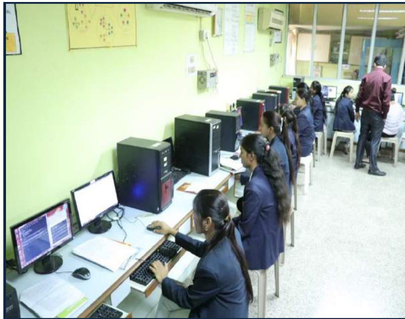
Picture 4 Computer Lab I