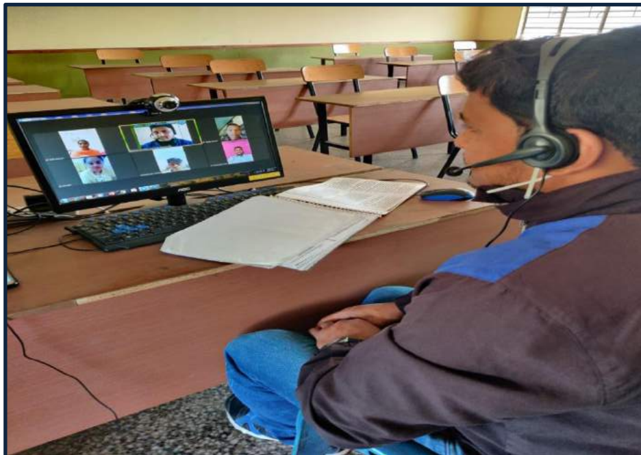
Picture 8 E-Classroom