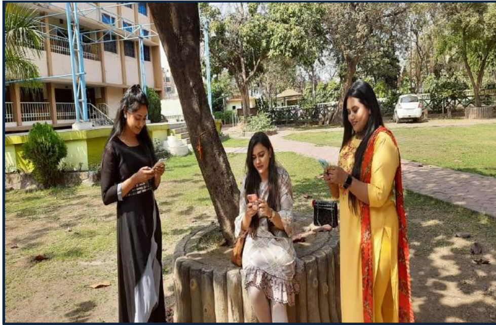
Picture 7 Wi-Fi enabled Campus