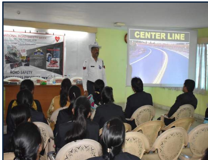
Picture 2 Audio Visual Room