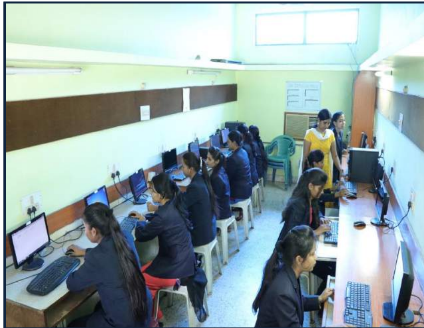
Picture 5 Computer Lab II