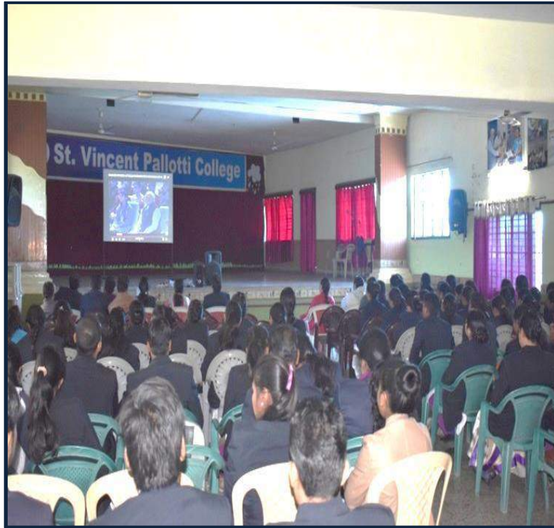
Picture 1 Seminar hall